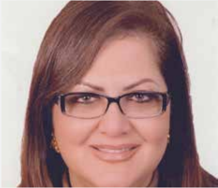
Dr. Hala Al-Saeed

Minister of Planning, Monitoring and Administrative Reform