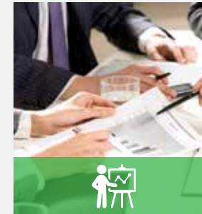
Professors and CSR & Marketing Managers