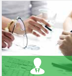
Private Sector Top Management