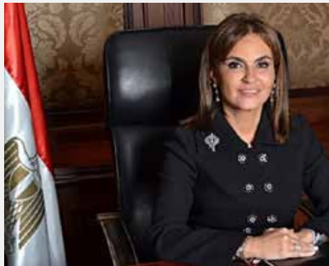
Dr. Sahar Nasr

Minister of Electricity and Renewable Energy