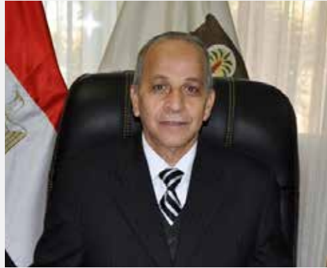
General Mohammed Abdel Rahman Qalyubia Governor