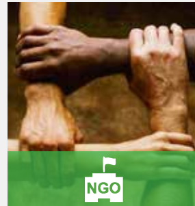
NGOs And Intergovernmental Entities' Representatives